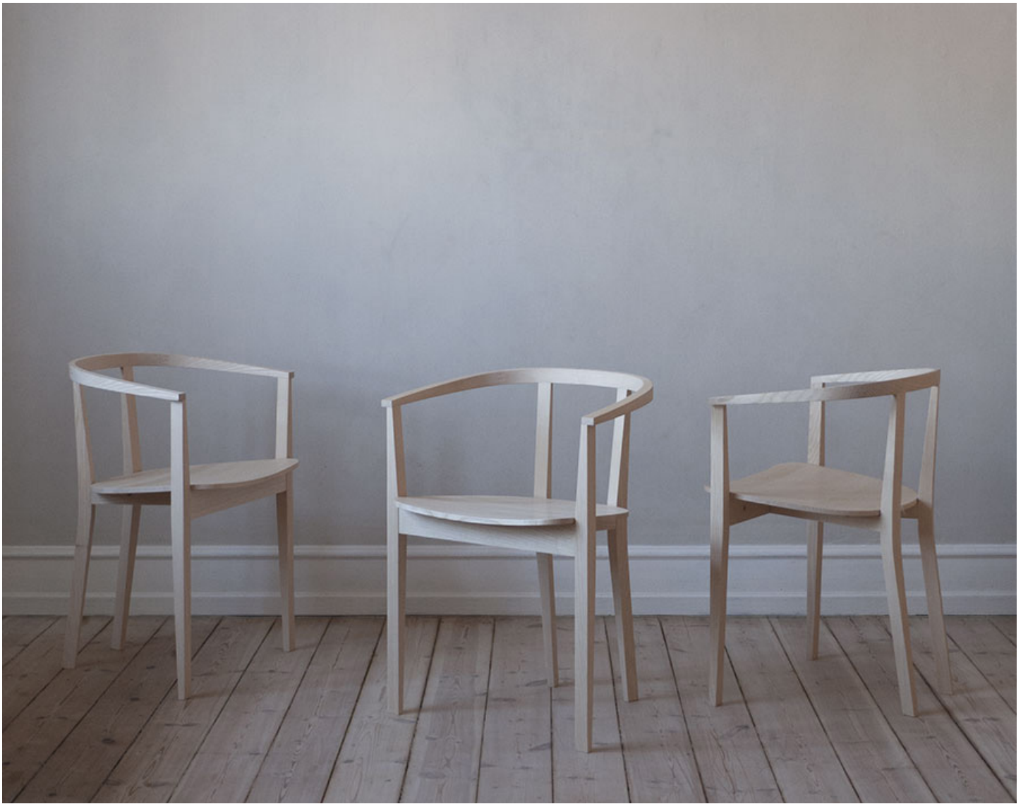
Chair Awarded in open competition 2010, built 2016