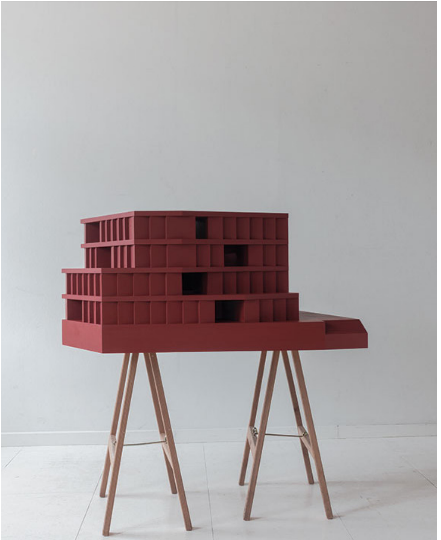
Natural History Museum 2nd prize in open competition 2009, exhibited at the Venice Biennale 2016