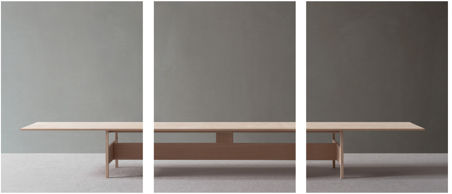
Marienborg Table In collaboration with Victor Julebæk. Built 2019