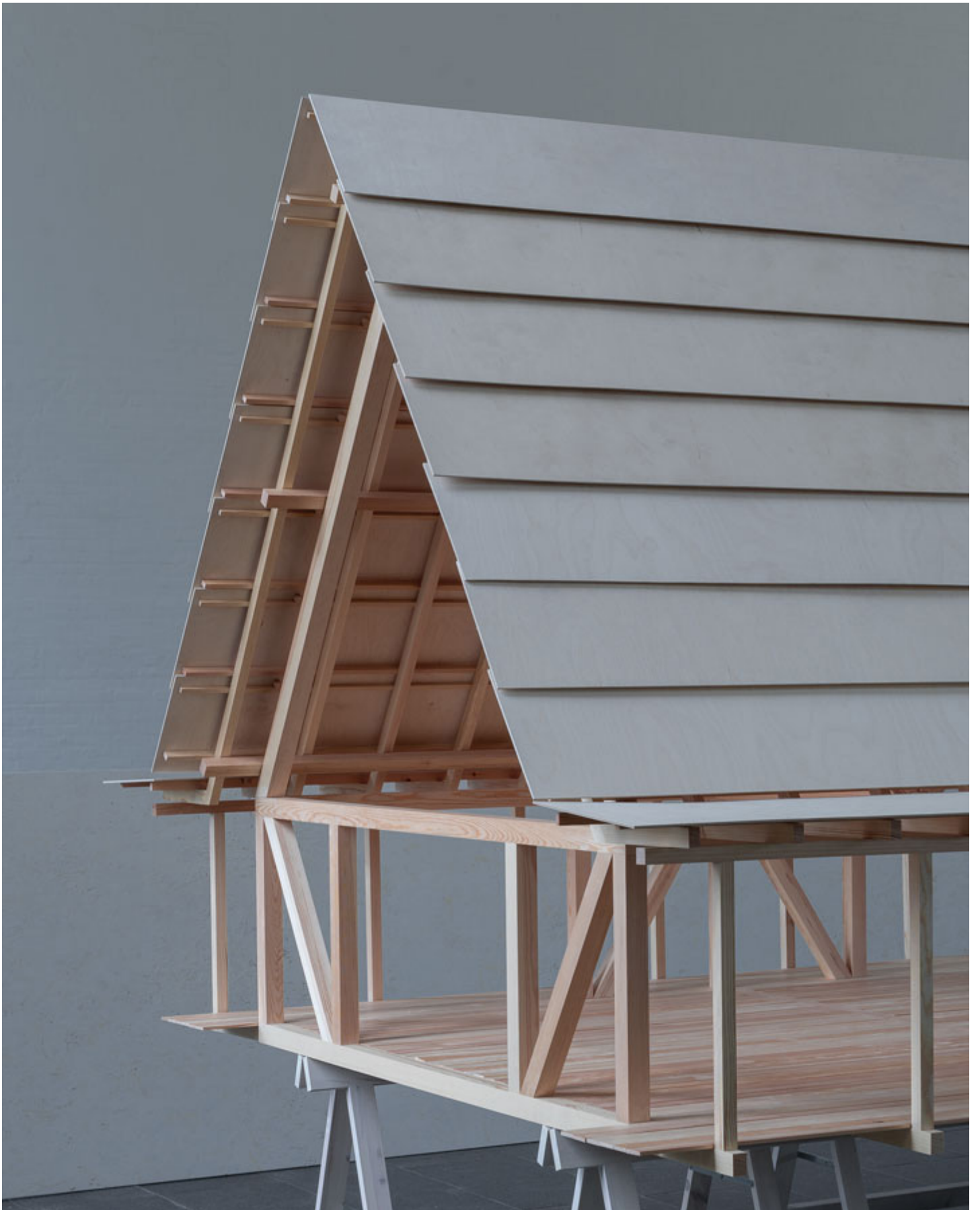
A House like Me Artistic research in architecture 2019